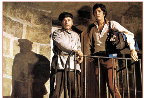
Photos: Frank Langella. (Frank Langella) top; Frank Langella, Dracula , 1979. (Moviestore Collection Ltd ) lower left; The Twelve Chairs , 1970. (RGR Collection) lower right.